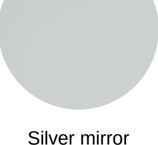
Silver mirror (Non-toughened)

Tinted mirrors add a unique style. We supply a range of tinted mirrors to complement your project. Some of our tinted mirrors are also available as toughened making them suitable for use behind a heat source.