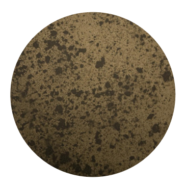
Really Rough Bronze Tinted (Toughened)