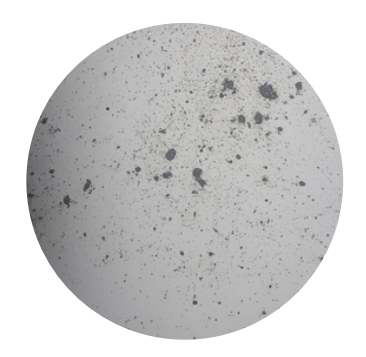
Vintage Antiqued Mirror (Toughened)