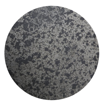
Really Rough Antiqued Mirror (Toughened)

Our antique mirrors are a stunning product which character to your home. We supply both handmade distressed toughened antique mirrors, as well as safety backed antique mirrors in a wide range of different finishes.