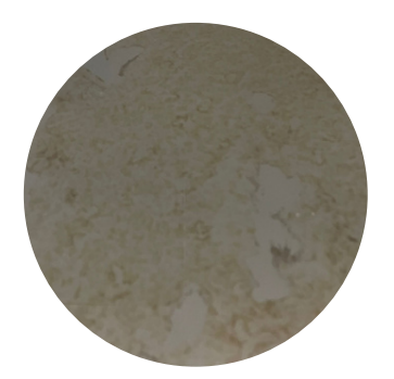
Antique Grey mirror (Non-toughened)