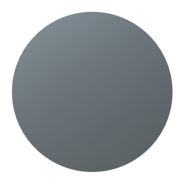
Grey mirror (Non-toughened)