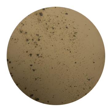
Vintage Bronze Tinted (Toughened)