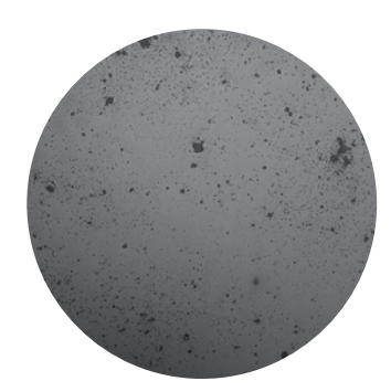
Vintage Grey Tinted (Toughened)