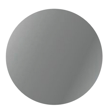
Satin grey mirror (Non-toughened)