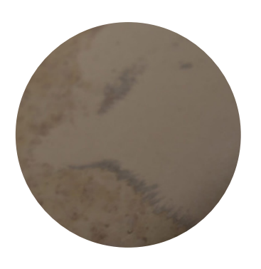
Antique Bronze mirror (Non-toughened)