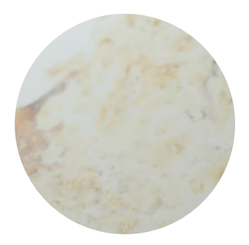
Antique Silver mirror (Non-toughened)