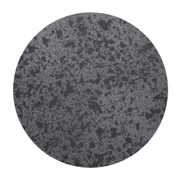
Really Rough Grey Tinted (Toughened)