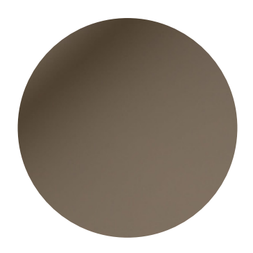
Bronze mirror (Non-toughened)